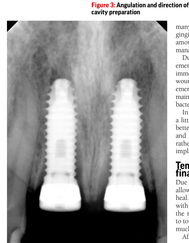
Figure 5: Z1 in situ with cover screw

After extraction, the cavity was prepared for implant placement using drills and screw tap – necessary due to the shape of the implant and to guarantee good primary