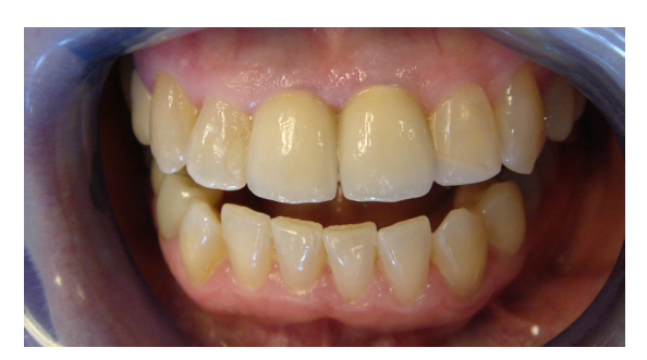
Figure 10: Final restorations