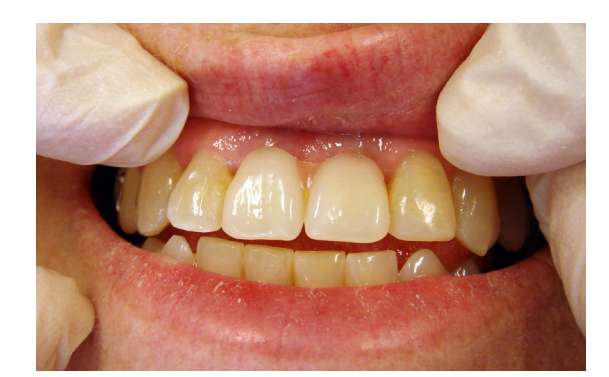
Figure 7: Temporary partial denture

An indirect transfer impression was used for the crowns (Figures 8 and 9). In this case, it was decided that each implant would be fitted with a separate crown rather than one conjoined restoration, regarding long-term maintenance and assurance. Indeed, should something happen to the implant 15-20 years into the future, it would be easier to manage just one tooth rather than a fused crown.