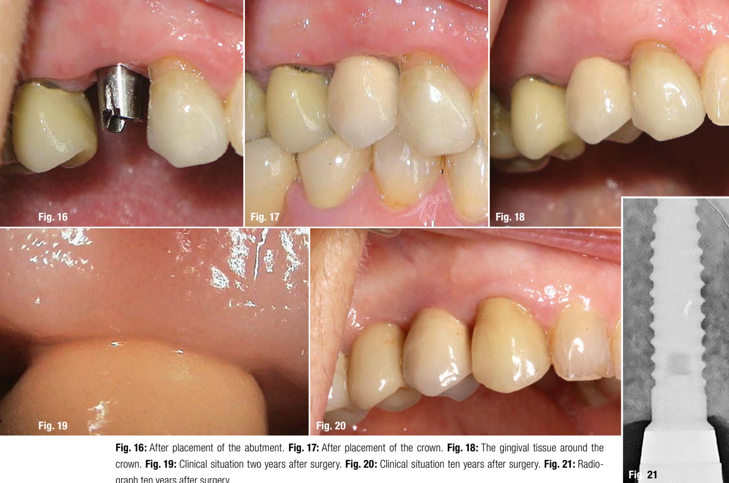
Fig. 16: After placement of the abutment. Fig. 17: After placement of the crown. Fig. 18: The gingival tissue around the crown. Fig. 19: Clinical situation two years after surgery. Fig. 20: Clinical situation ten years after surgery. Fig. 21: Radiograph ten years after surgery.